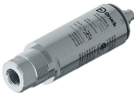
PM700E (Gauge, Absolute)